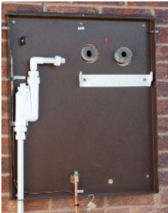
1. Install the wall plate