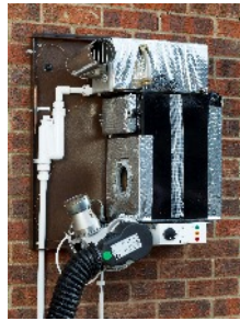
2. Fit the heat exchanger