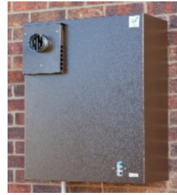
3. fit the "one-piece" cover